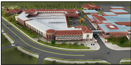
Artist’s rendition from the College of Veterinary Medicine’s website.

Join other PURA members on a tour of Purdue’s new veterinary hospital complex on Friday, October 21, 2022 at 2:30 p.m. ET . Dedicated in April, the new facilities are located adjacent to Lynn Hall, which has served as the home of the College of Veterinary Medicine since its inception. Notable components of the new complex include a separate hospital for equine patients, a stand-alone facility for farm animals, and a new structure that expands the Small Animal Hospital by adding 65,000 square feet to the existing facility in Lynn Hall. The new David and Bonnie Brunner Small Animal Hospital building provides state-of-the-art space for Emergency and Critical Care Service and Intensive Care Unit as well as Anesthesiology, Diagnostic Imaging, Internal Medicine, Orthopedic and Soft Tissue Surgery, and Neurology and Physical Therapy. It doubled the number of exam rooms and added 11 new operating rooms.